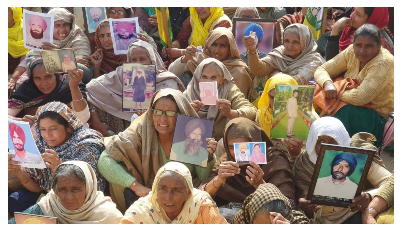
Families of farm suicide victims at the protest stage.

The overwhelming majority of India's workers — as many as 90% by some estimates — are informally employed in insecure, poorly paid jobs that lack social protections. For precarious urban workers, rural areas are a vital base of support — an emergency cushion against unemployment, a place to raise children or recuperate from illness, a source of provisions that supplement meagre incomes — and they retain close ties with their places of origin. Rural people are also responding to the growing impossibility of earning a decent living from agriculture not by leaving the sector entirely, but through increasingly complex and piecemeal ways of making ends meet. Some family members continue farming while others supplement their household income with waged work, including through circular or seasonal migration to urban areas. Rural and urban people and livelihoods in India are therefore increasingly intertwined. This situation was painfully apparent during the COVID-19 pandemic in 2020: migrant workers' precarious employment was suddenly terminated by a stringent nationwide lockdown, forcing a mass exodus from cities to their rural homes where at least basic survival was assured.