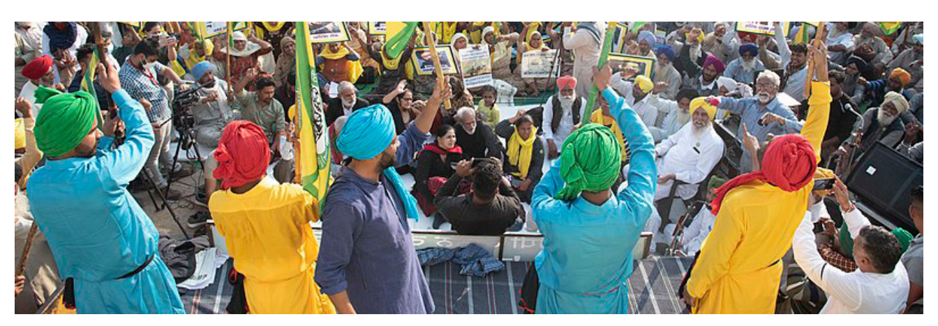
Farmers' protest site at Delhi's Tikri border.

Such a framing of these issues is echoed by farmers' movements<sup>13</sup> and activist-scholars<sup>14</sup> around the world who have also questioned neoliberal interpretations of agrarian crises in diverse contexts and called for solutions similar to the ones proposed by the Kisan Andolan. The protests therefore received widespread support and solidarity from global food sovereignty struggles, including the international peasant movement La Via Campesina.