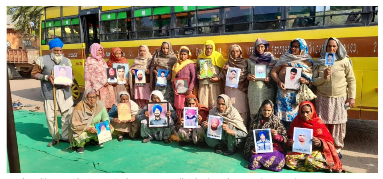
Families of farm suicide victims join the protests at Delhi's borders.

The farm laws aimed to intensify and deepen agricultural liberalisation in India. The broad rural coalition that overturned them was able to do so because it worked to highlight shared interests in confronting this process. Caste and class continued to matter, and there were some unions who insisted that the movement be primarily focused on farmers. Yet there was also an effort to overcome historical political divides between different groups of rural working people. A crucial basis for these emerging cross-class and -caste solidarities was a shared acknowledgement that the large-scale corporatisation of agriculture advanced by the farm laws posed an existential threat to diverse food producers.